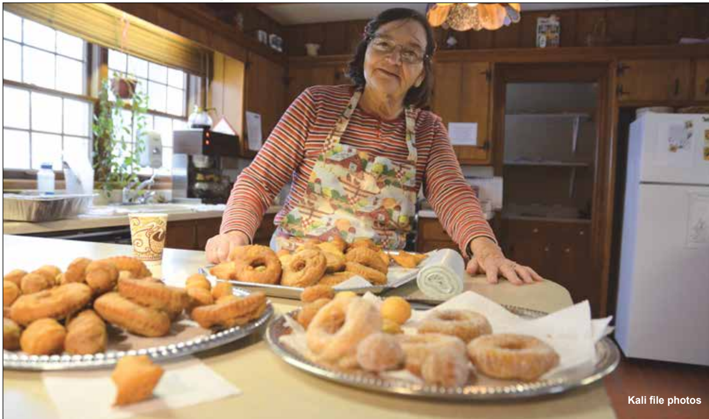
Kali file photos