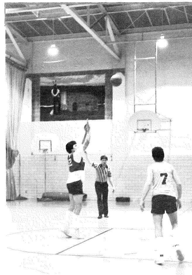
White of Lac Du Flambeau makes an easy extra point