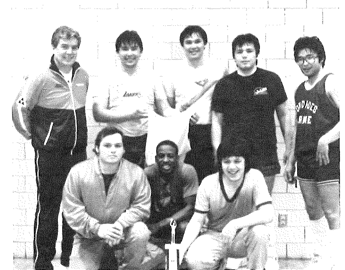
Second Place Team Lac Du Flambeau Warriors