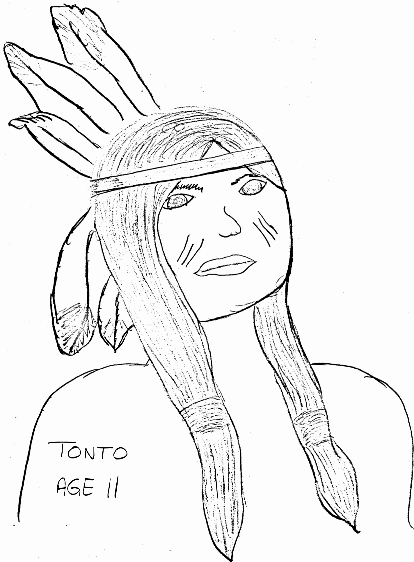
TONTO AGE 11