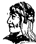
UGWADEMOLUM YATEHE Because of the help of this Oneida Chief in cementing a friendship between the six nations and the Colony of Pennsylvania, a new nation, the United States, was made possible