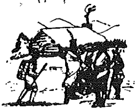
Onaidas bringing several hundred bags of corn to Washington's starving army at Valley Forge, after the colonists had consistently refused to aid them.