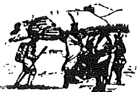
Onedias bringing several hundred bags of corn to Washington's starving army at Valley Forge, after the colonists had consistently refused to aid them.