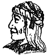
UGWA OEHOLUH YATEHE Because of the help of this Oneida Chief in cementing a friendship between the six nations and the Colony of Pennsylvania, a new nation, the United States was made possible.