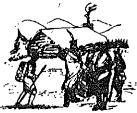
Onondagas bringing several hundred bags of corn to Washington's starving army at Valley Forge, after the colonists had consistently refused to aid them.