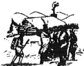
Onondas bringing several hundred bags of corn to Washington's starving army at Valley Forge, after the colonists had consistently refused to aid them.