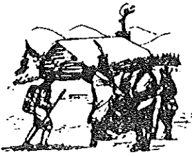
Onondas bringing several hundred bags of corn to Washington's starving army at Valley Forge, after the colonists had consistently refused to aid them.