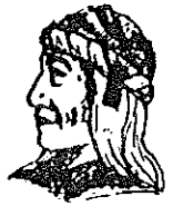
UGWA DEMOLUH YATENE Because of the help of this Oneida Chief in cementing a friendship between the six nations and the Colony of Pennsylvania, a new nation, the United States was made possible.