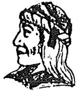
UGWA DENOLUH TATENE

Because of the help of this Onondaga Chief in cementing a friendship between the six nations and the Colony of Pennsylvania, a new nation, the United States was made possible.