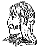
UGWA BENDLUM YATEHE Because of the help of this Oneida Chief in cementing a friendship between the six nations and the Colony of Pennsylvania, a new nation, the United States was made possible.