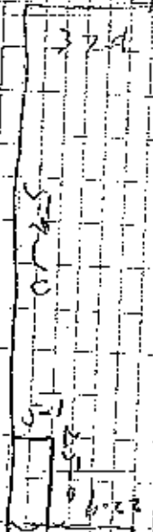
PLATE NO. 1000