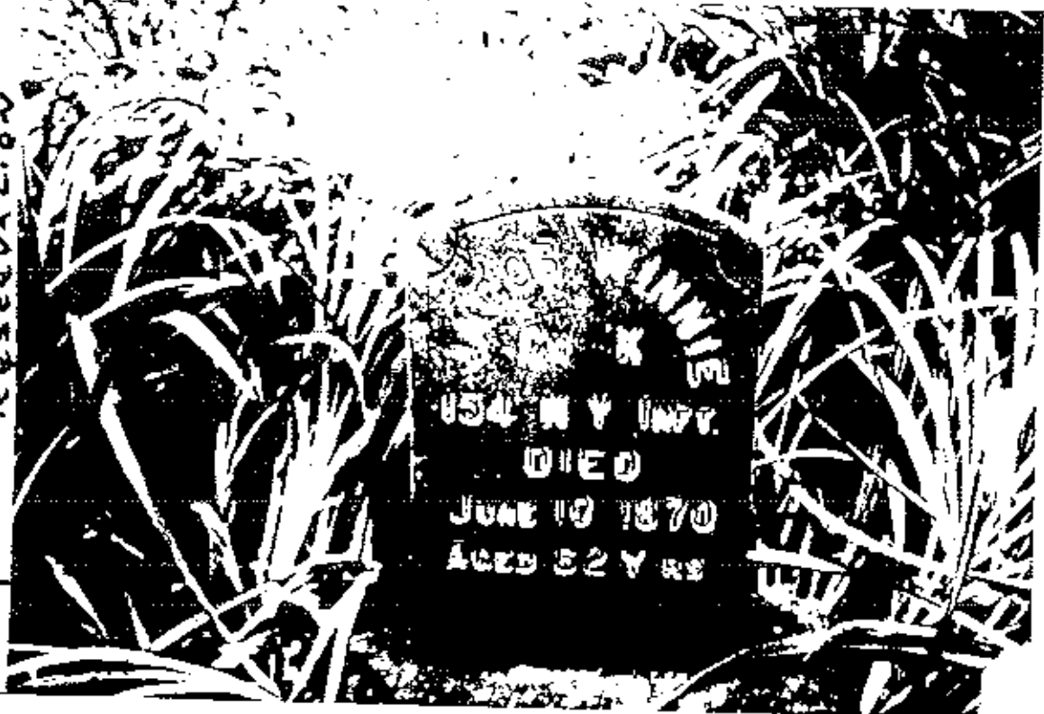
Winnie Tombstone Cattaraugus Indian Reservation